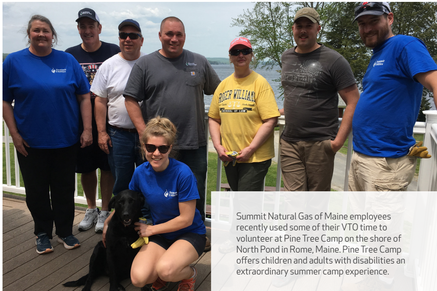
Summit Natural Gas of Maine employees recently used some of their VTO time to volunteer at Pine Tree Camp on the shore of North Pond in Rome, Maine. Pine Tree Camp offers children and adults with disabilities an extraordinary summer camp experience.